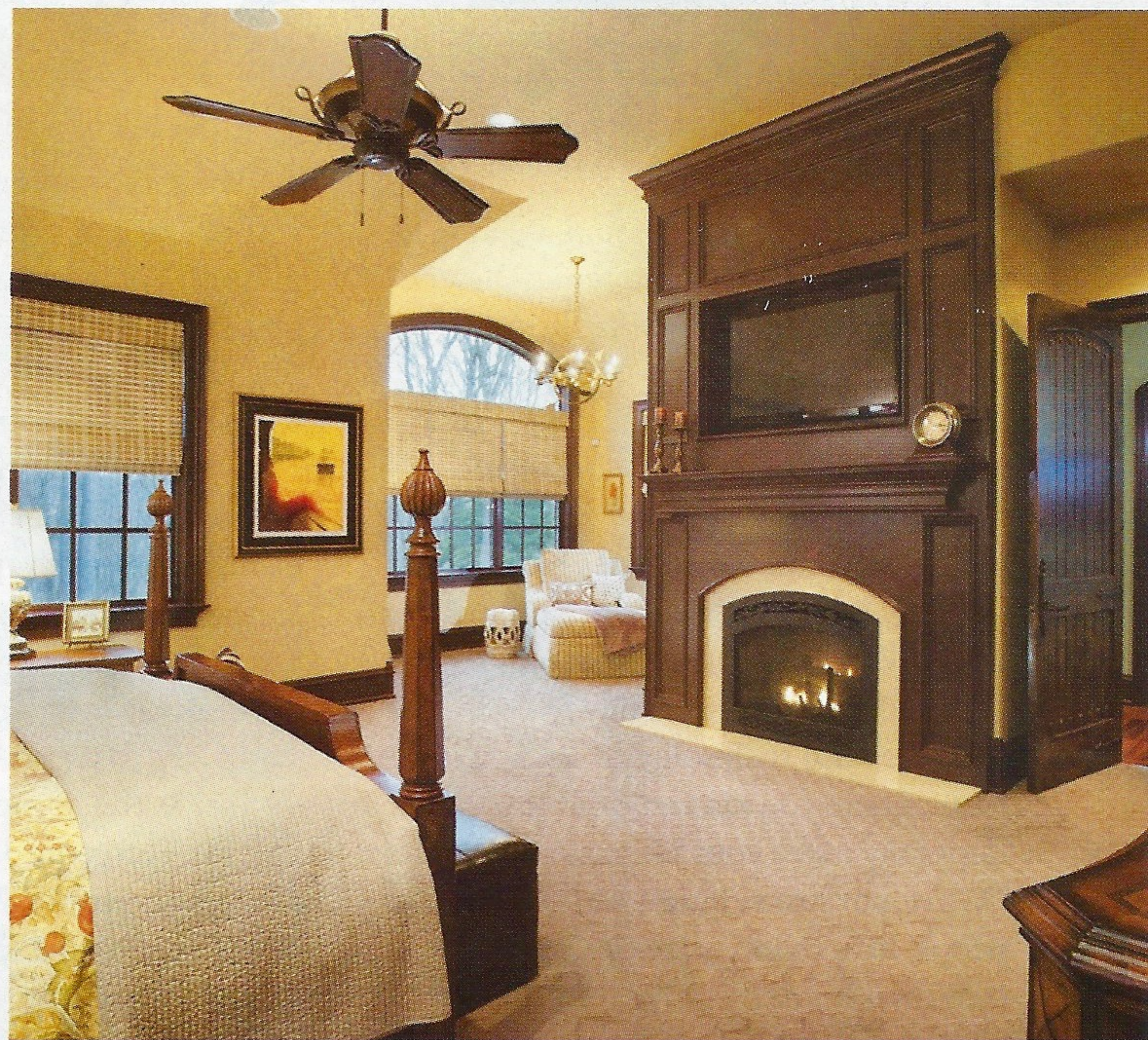
CHALET INSPIRED: (Clockwise from opposite page) The kitchen's stonework and curved archways are among the countless custom touches throughout the Mostoller home; a two-story fireplace and post-and-beam ceiling lend a sense of drama to the living room; another fireplace brings relaxed elegance to the master bedroom; in the master bathroom, a shimmering glass-tile wall hides the walk-around shower.