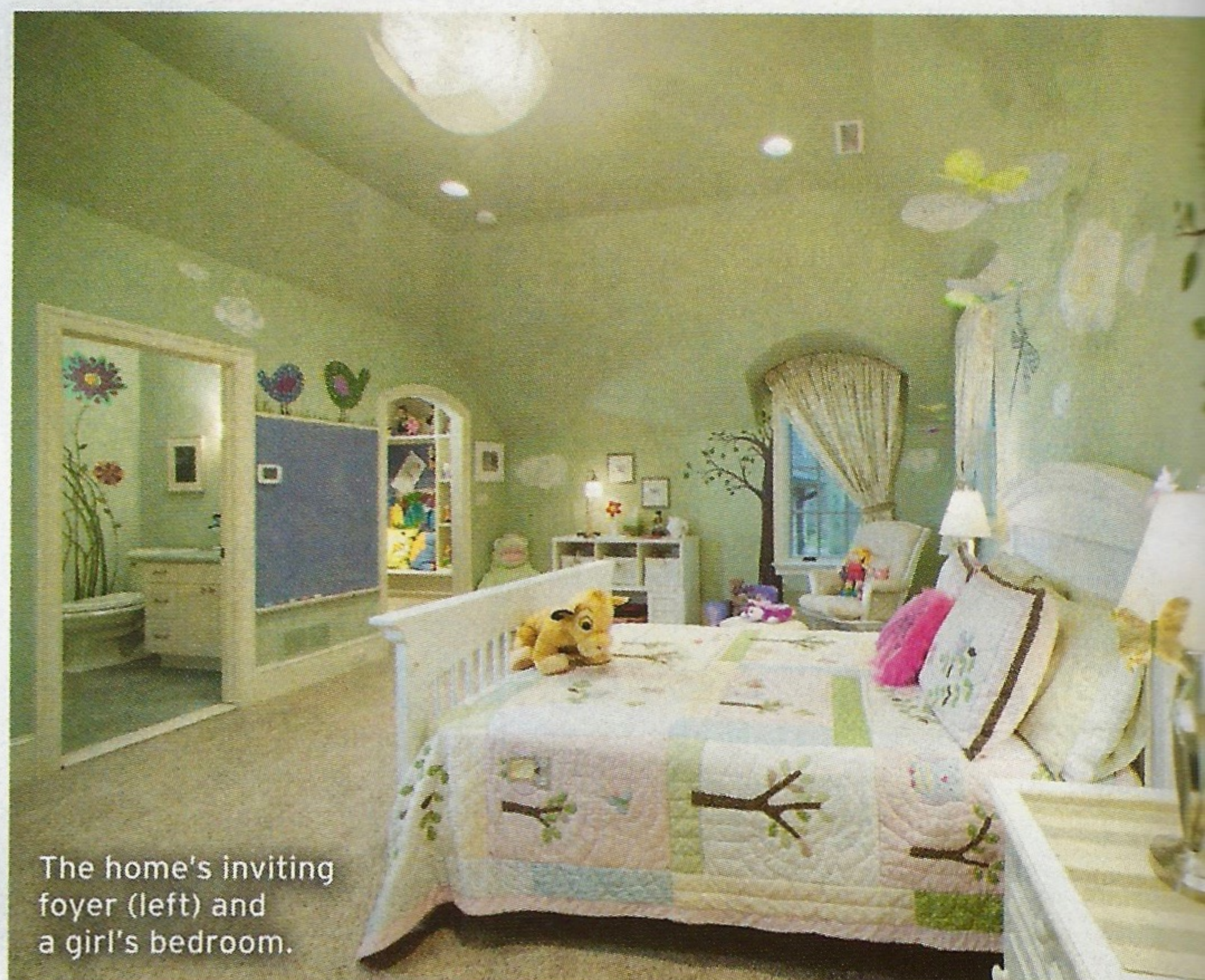
The home's inviting foyer (left) and a girl's bedroom.